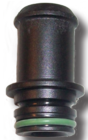
CODE 550109000 HOSE CONNECTION D.14 WITH OR