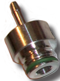
CODE 530078000 HOSE CONNECTION D.4,5 WITH OR