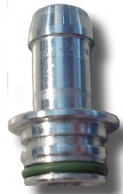
CODE 530073000 HOSE CONNECTION D.10 ASSEMBLED