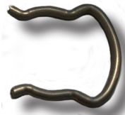
CODE 4020001 STOP RING D.1,5