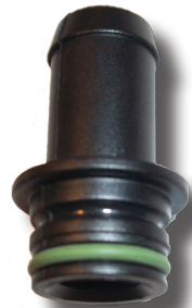
CODE 4530023 DISTRIBUTOR HOSE CONNECTION D.12 WITH OR