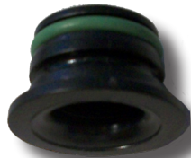
CODE 4770011 DISTRIBUTOR CAP WITH OR