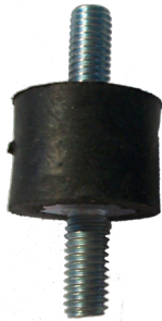
CODE SUPP01001 DOUBLE M. ANTIVIBRATING BRACKET M6