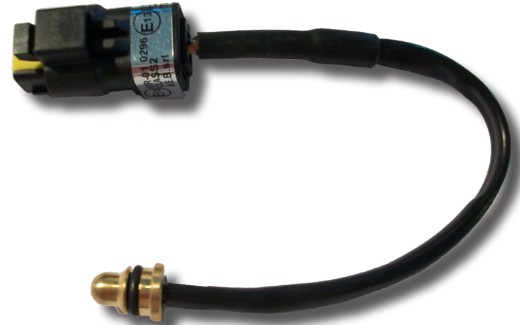
CODE AEB369 INJ TEMPERATURE SENSOR