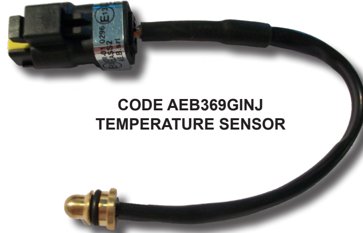
CODE AEB369GINJ TEMPERATURE SENSOR