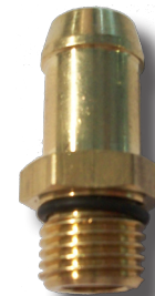
COD. AEBRC001 ASSEMBLED G 1/4 HOSE CONNECTION D.10